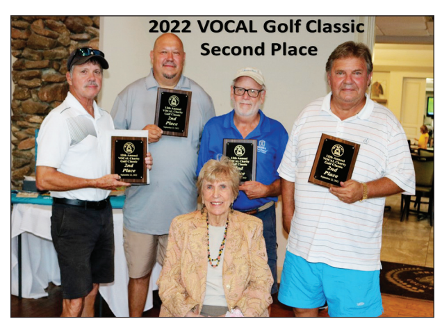
- 2022 2nd Place -