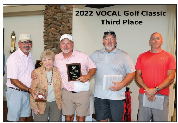
- 2022 3rd Place -