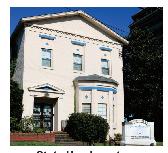
State Headquarters The Quenette Shehane Center 422 South Court Street Montgomery, Alabama 36104

The 13-hole "Arrowhead" Course at Arrowhead Country Club features 6,710 yards of golf from the longest tees for a par of 72. The Course rating is 71.5 and it has a slope rating of 123 on Bermuda grass.